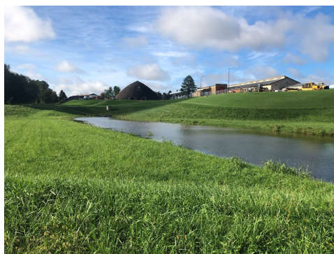
Post storm event

The goal of this study is to provide the results of monitoring to MDE and the Chesapeake Bay Program to adopt the enhanced sand filter design as an approved BMP.