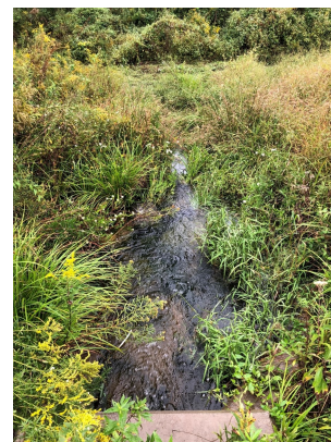
Stable outfall discharge dewatering facility