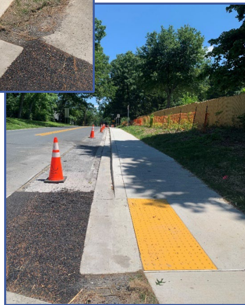
Right: northbound Johnsville Rd, looking towards Liberty HS