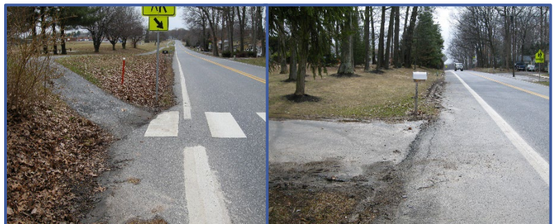
Above Left: crosswalk and walking path at Johnsville Rd & Victor Dr Above Right: northbound Johnsville Rd, looking towards Eldersburg ES