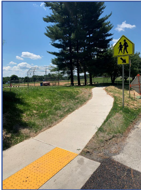
Above: sidewalk connecting to walking path at Johnsville Rd & Victor Dr

In 2015 the Carroll County Department of Planning applied for and received funding for a Safe Routes to School Grant to construct a sidewalk along Johnsville Road. The project is to provide safe passage along the east side of Johnsville Road from Eldersburg Elementary School to the intersection of Bartholow Road, across from Liberty High School. This is a heavily traversed road by pedestrians and children who currently walk in the street. The project, which is scheduled to be completed by July 2022, includes 5' wide sidewalk with an adjacent 6" vertical curb to provide a vertical separation from vehicles. The improvements are constructed wholly within the county right-of-way. State and county stormwater management requirements are being met via a bioretention area on the Liberty High School property and a bioswale on the Eldersburg Elementary School Property.