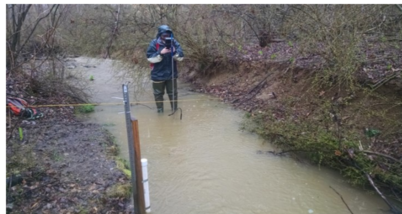
Discharge measurement to establish flow conditions within receiving channels