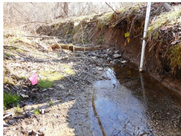
PVC tubing houses pressure transducer that records stage height/flashiness