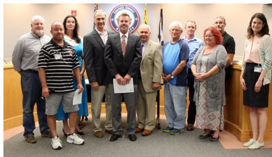
Bryan Shumaker Institution