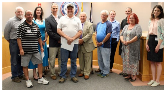
Legacy Septic & Excavation LLC Business