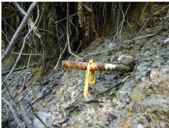
Bank Pin measuring lateral retreat from erosion

The results of the study which should be available mid-2019 aim to provide recommendations to credit flow controlling BMPs as a hydrogeomorphic stream stabilization technique for inclusion as part of the nutrient and sediment credits for the Chesapeake Bay Total Maximum Daily Load (TMDL).