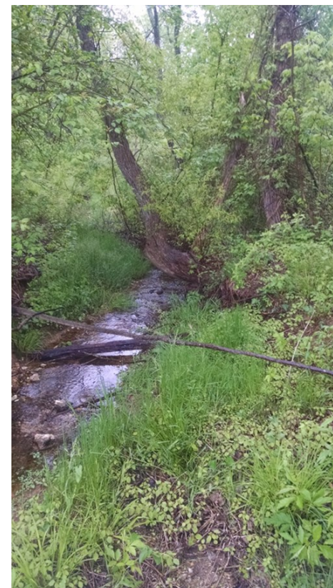
Westminster High School, 2018