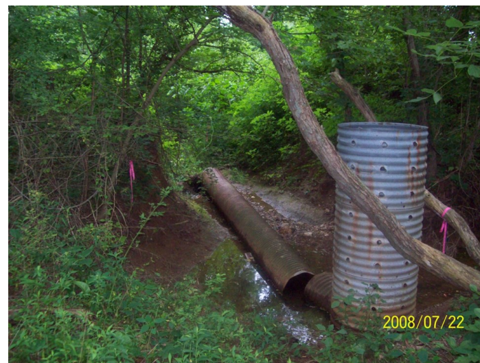
Westminster High School, 2008