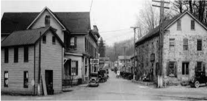
Main Street Sykesville, MD before the fire in the 1930's.