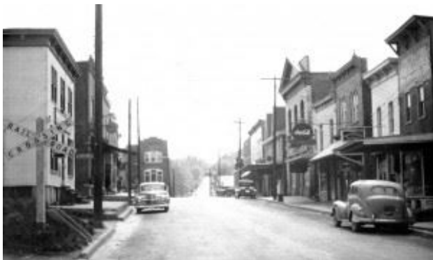
Mt. Airy, MD Main Street 1953