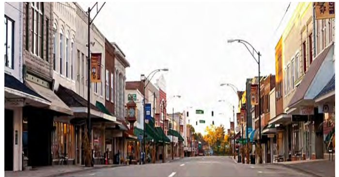
Mt. Airy, MD now.