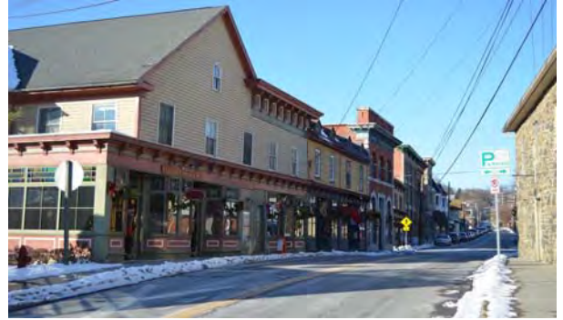
Main Street Sykesville, MD now.