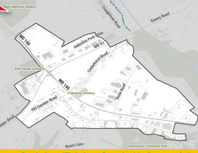
Study Area (Finksburg Sustainable Community)

Finksburg Bicycle and Pedestrian Planning and Feasibility Study