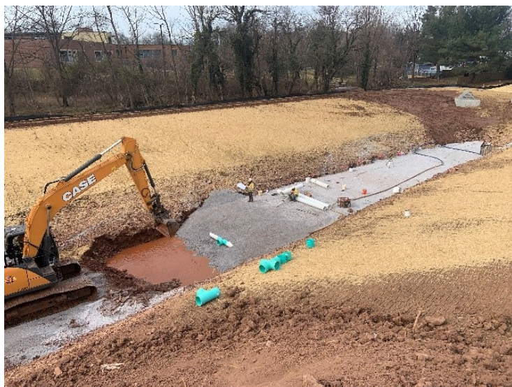
Trevanion Terrace Underdrain