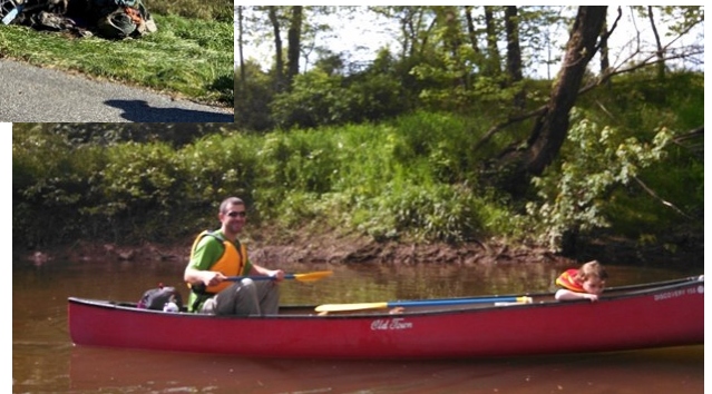
Monocacy Board Float Trip ↓