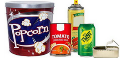
Empty aluminum and steel cans