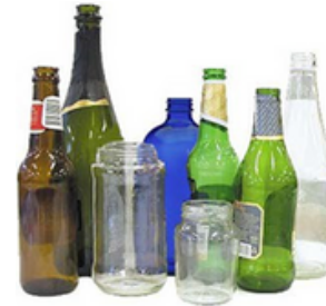
Empty bottles and jars (all colors, remove lid)