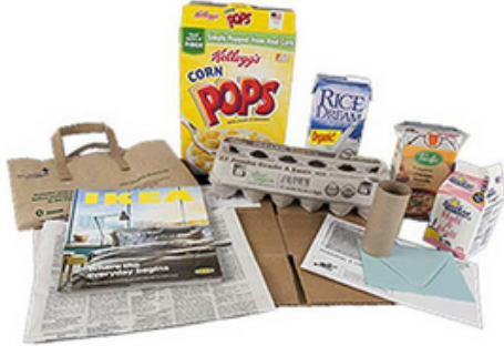
Paper, cartons, and cardboard (clean and dry)