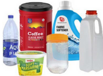
Empty bottles, tubs, jars, and jugs (leave lid)